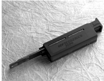
5-Point protector, narrow version